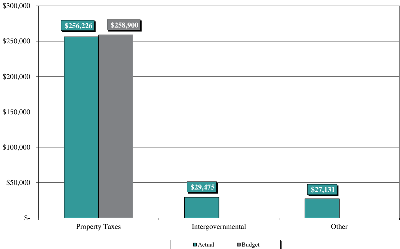
2013 Administrative Fund Revenues Budget and Actual

In 2013, Administrative Fund revenues were $ 53,932 over budget. Property taxes were under budget $ 2,674 as the District budgets at the full levy amount and does not budget for the effect of delinquent amounts. Intergovernmental revenues and other revenues, including grants, income, contributions and agricultural market value credits, are not budgeted for as the amounts vary each year and are not predictable at the time the District's budget is determined.