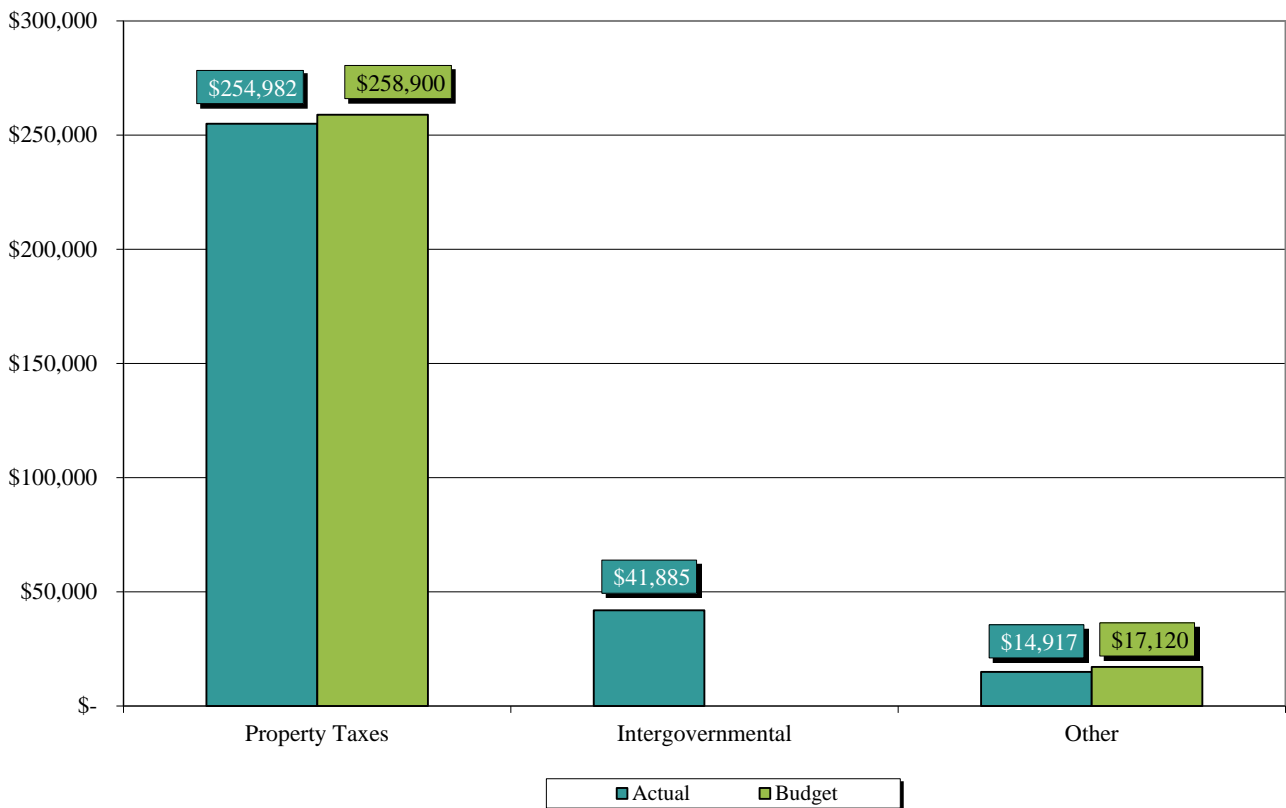
2012 Administrative Fund Revenues Budget and Actual

In 2012, Administrative Fund revenues were $ 35,764 over budget. Property taxes were under budget $ 3,918 as the District budgets at the full levy amount and does not budget for the effect of delinquent amounts. Intergovernmental revenues, including grants and agricultural market value credits, are not budgeted for as the amounts vary each year and are not predicitable at the time the District's budget is determined. Other revenues were similar to budgeted amounts, coming in $ 2,203 under budget.